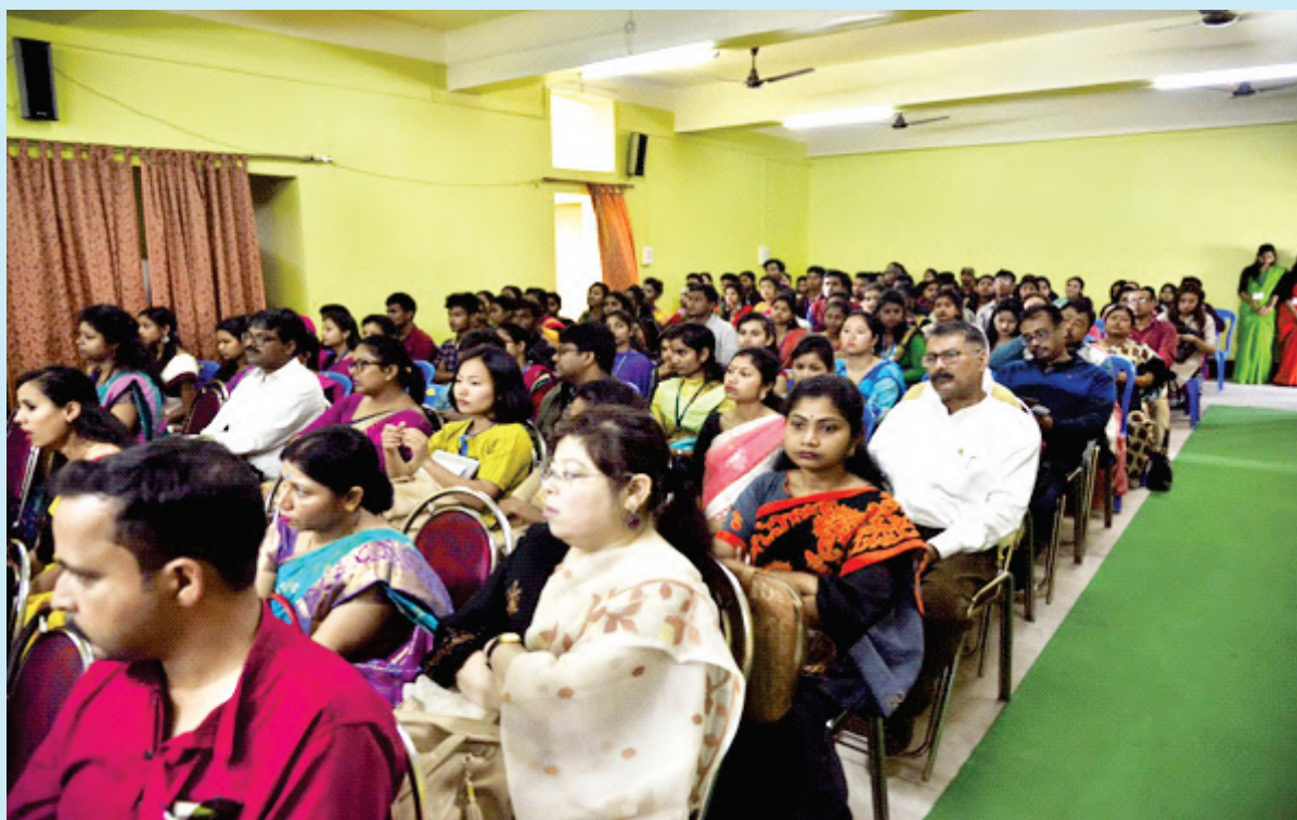
Two-day International Seminar on 'Marital Relations: Society and Literature' on March 5-6, 2020

More than 60 research papers were presented on various issues related to the theme in Bengali, Hindi, English and Nepali language. Teachers, research scholars and students from all over the country as well as from Bangladesh were actively participated in the seminar.