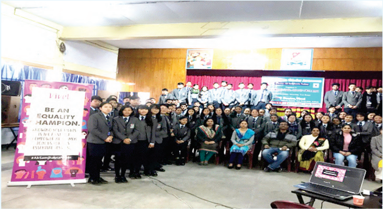
Siliguri College, Siliguri