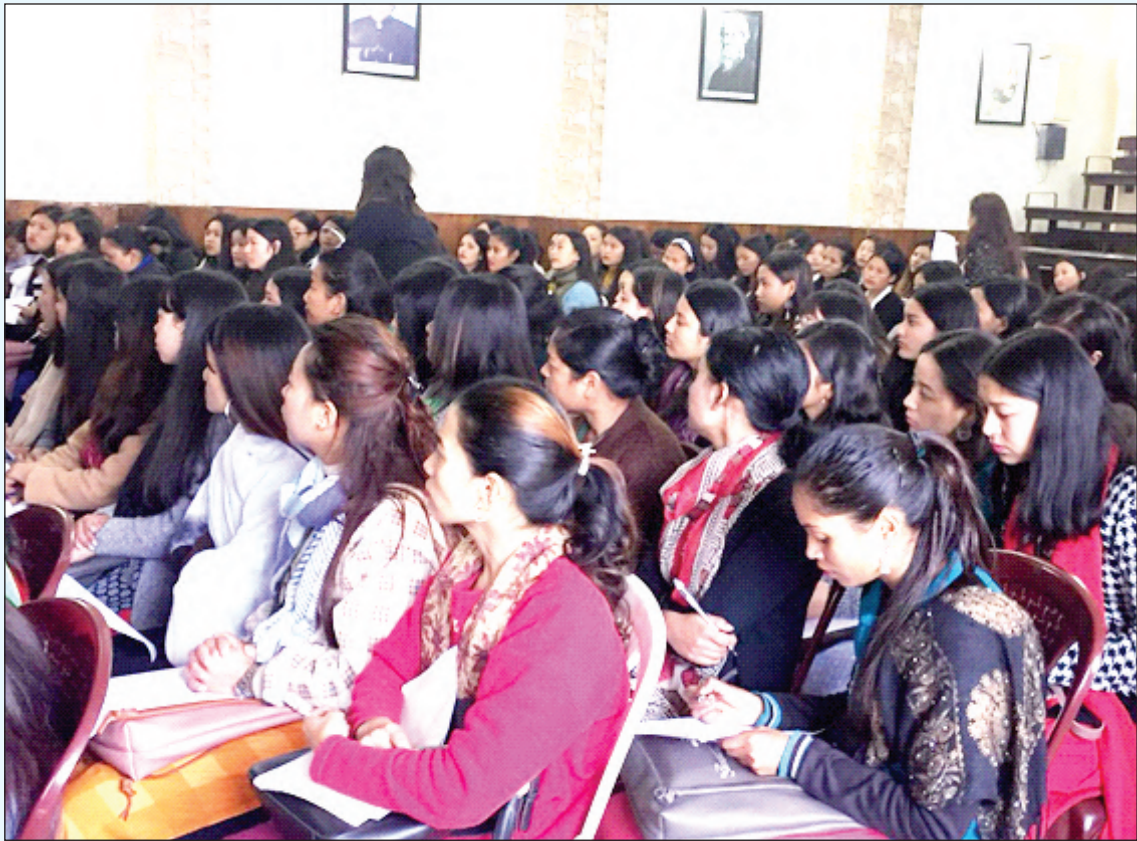
St. Joseph's College, North Point, Darjeeling